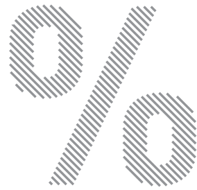
FIGURES SHOWN AS PERCENTAGES

The chart below identifies issues raised in cases referred to the tribunal during 2013/14.