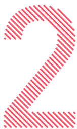
LOADING & UNLOADING