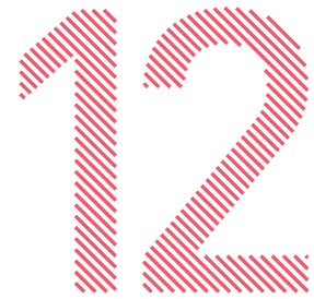
PERMITS & PAY AND DISPLAY