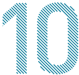
SIGNS & LINES